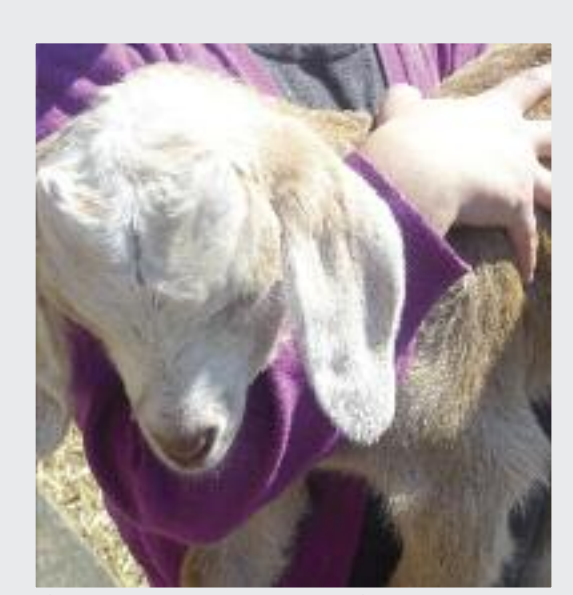
Children have a responsibility to look after the animals at Skolefritidsordinger Skraenten