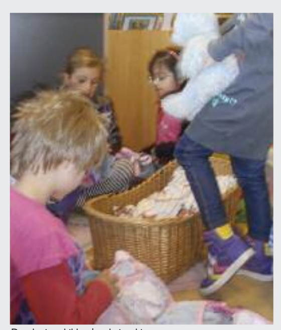
Developing children's relationships

"It did seem clear to me from the visit that pedagogues can command an almost unique range of skills. It is not that the skills are unique in themselves but I had not previously encountered the mix contained within a single professional entity. Hence, it seems that pedagogues are able to assess a child's needs in any given situation on the basis of a fairly comprehensive knowledge and understanding of child development and then plan an intervention strategy which meets those needs in that given situation. This, again, requires a quite comprehensive range of skills including practical skills such as crafts and cooking etc together with quite subtle and sophisticated interpersonal strategies in which the pedagogue uses their own personality in all its aspects as the primary tool of intervention. Other skills which can be observed are more familiar from our own practice of social work education. These include reflective practice and evaluation which are clearly