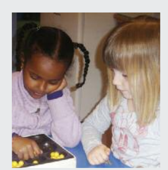
"The strength of relationships was apparent as children played together"