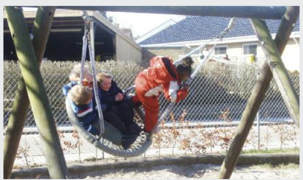
Children playing outdoors at the integrated day-care centre, Vestergård Øst, Aarhus

This model could help address the challenges outlined above by creating a new and very flexible professional who is able to work with children and families across different settings and strengthen collaboration across services. Existing