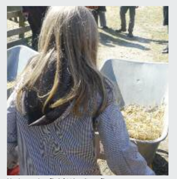
Hard at work at Skolefritidsordinger Skraenten

Unlike most out-of-school care facilities attached to schools in the UK, this one has its own rooms and resources. Despite