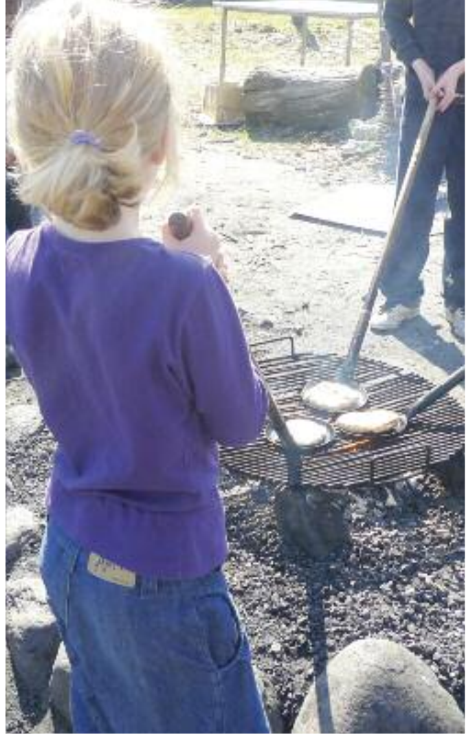
Baking flat bread over an open fire at the out-of-school care facility Skraenten (p17)

help shape the future of Scotland's children's sector workforce Exploring the benefits of Danish pedagogy