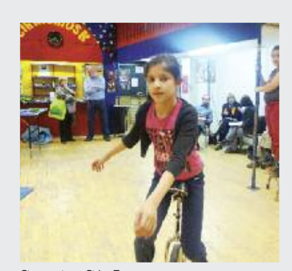
Circus antics at Cirkus Tvaers